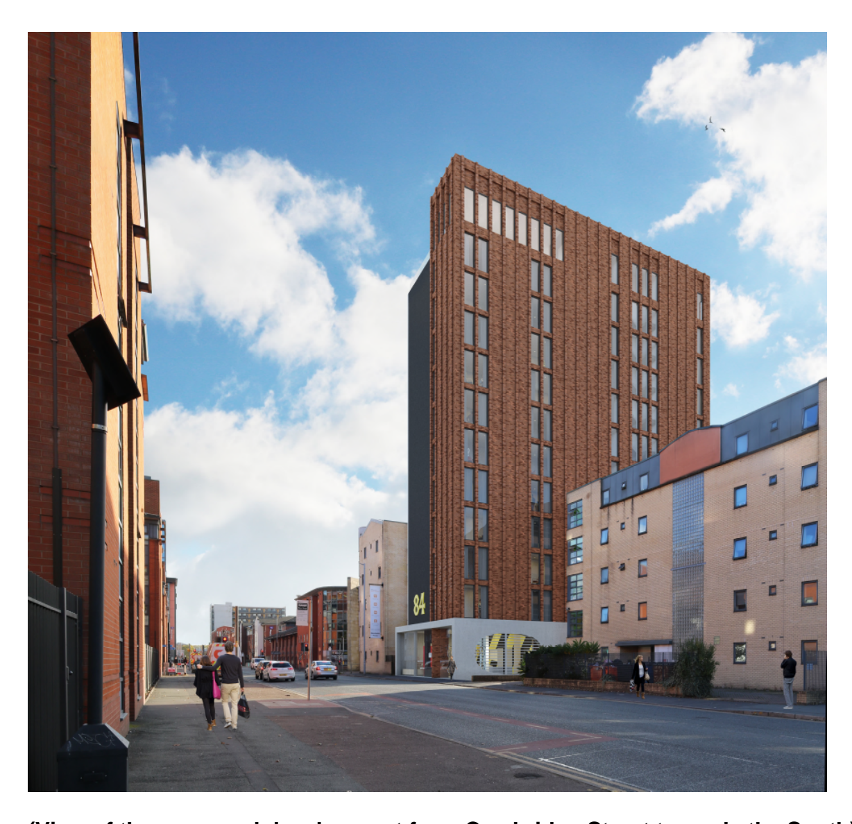
(View of the proposed development from Cambridge Street towards the South)