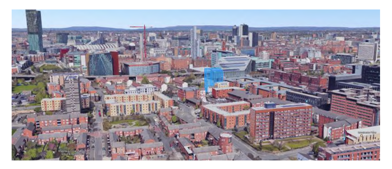
(View of the proposed development from south towards the City Centre)