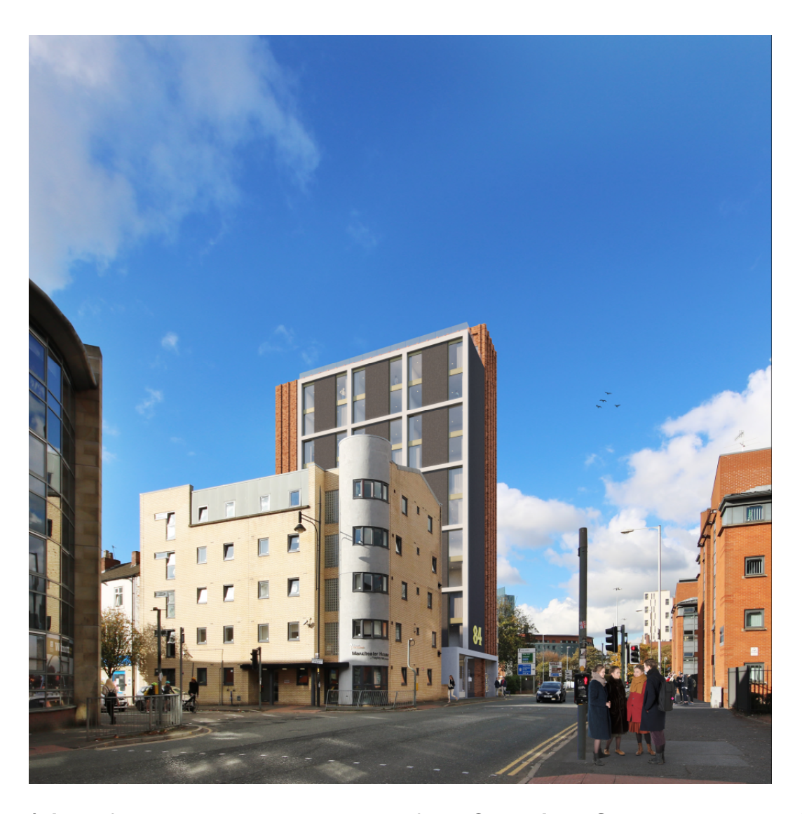
(View of the proposed development from Cambridge Street towards the City Centre)